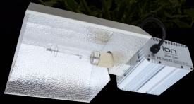
315W CMH 110-240V