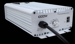
11000W DE/SE BALLAST 110-240V